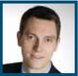
J. Pohl Wiesbaden (Germany)