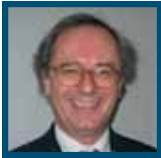
G. Costamagna Roma (Italy)