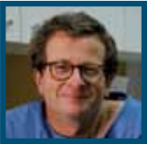
T. Ponchon Lyon (France)