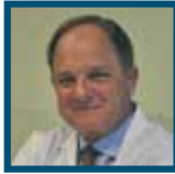
A. Malesci Milano (Italy)